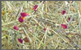
WILDSPITZE ROASA* [vɪltʃpɪtsə] [roàsə] ALPINE HAY WITH ROSE PETALS