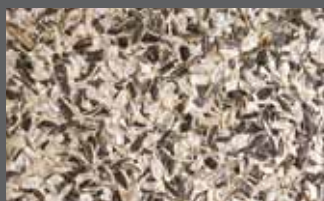
SUNNABLUMA ['zunablua:mà] SUNFLOWER SEED HUSKS