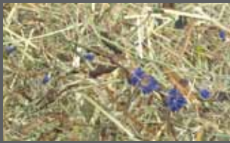
WILDSPITZE LAWENDL* [vɪltʃpɪtsə] [la'vendl] ALPINE HAY WITH LAVENDER AND CORNFLOWER BLOSSOMS