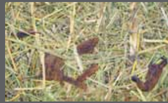
WILDSPITZE WANILLÄ* [vɪltʃpɪtsə] [va'nɪlæ] ALPINE HAY WITH VANILLA PODS