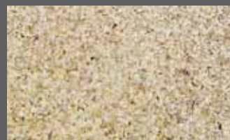
DINCKL ['dɪŋkl] SPELT HUSKS