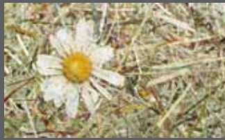
WILDSPITZE MARGERITTA* [vɪltʃpɪtsə] [ˌmɔrgə:'rɪta] ALPINE HAY WITH MARGUERITES