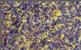
KORNBLUAMA BLAU* ['kɔrnblua:mà] [blaʊ] CORNFLOWER BLOSSOMS BLUE