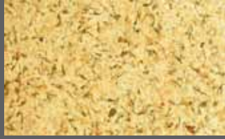
IASMIN** ['jazmi:n] JASMINE BLOSSOMS