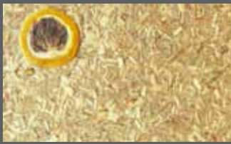
ZITROUNE** [tsi'trou:nə] LEMONGRASS CUT AND SLICES OF LEMON