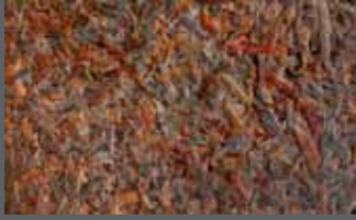
WANILLÄ** [va'nɪlæ] VANILLA PODS