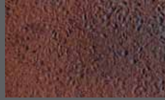
KAFEE** ['kafɛ:] COFFEE POWDER WITH BEAN RELIEF STRUCTURE