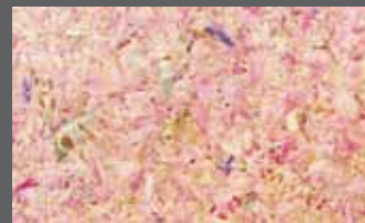
KORNBLUAMA PINCK* ['kɔrnblua:mà] ['pɪŋk] CORNFLOWER BLOSSOMS PINK