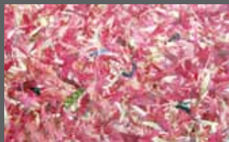
KORNBLUAMA ROAT* ['kɔrnblua:mà] ['roàt] CORNFLOWER BLOSSOMS RED