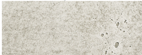
224 imi-beton vintage standard