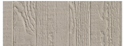
122 imi-beton timber formwork