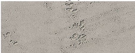
120 imi-beton smooth grey