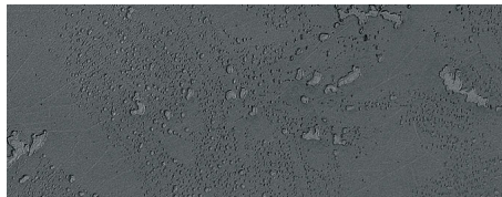
121 imi-beton smooth anthracite