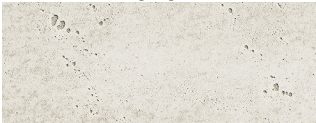
223 imi-beton vintage light